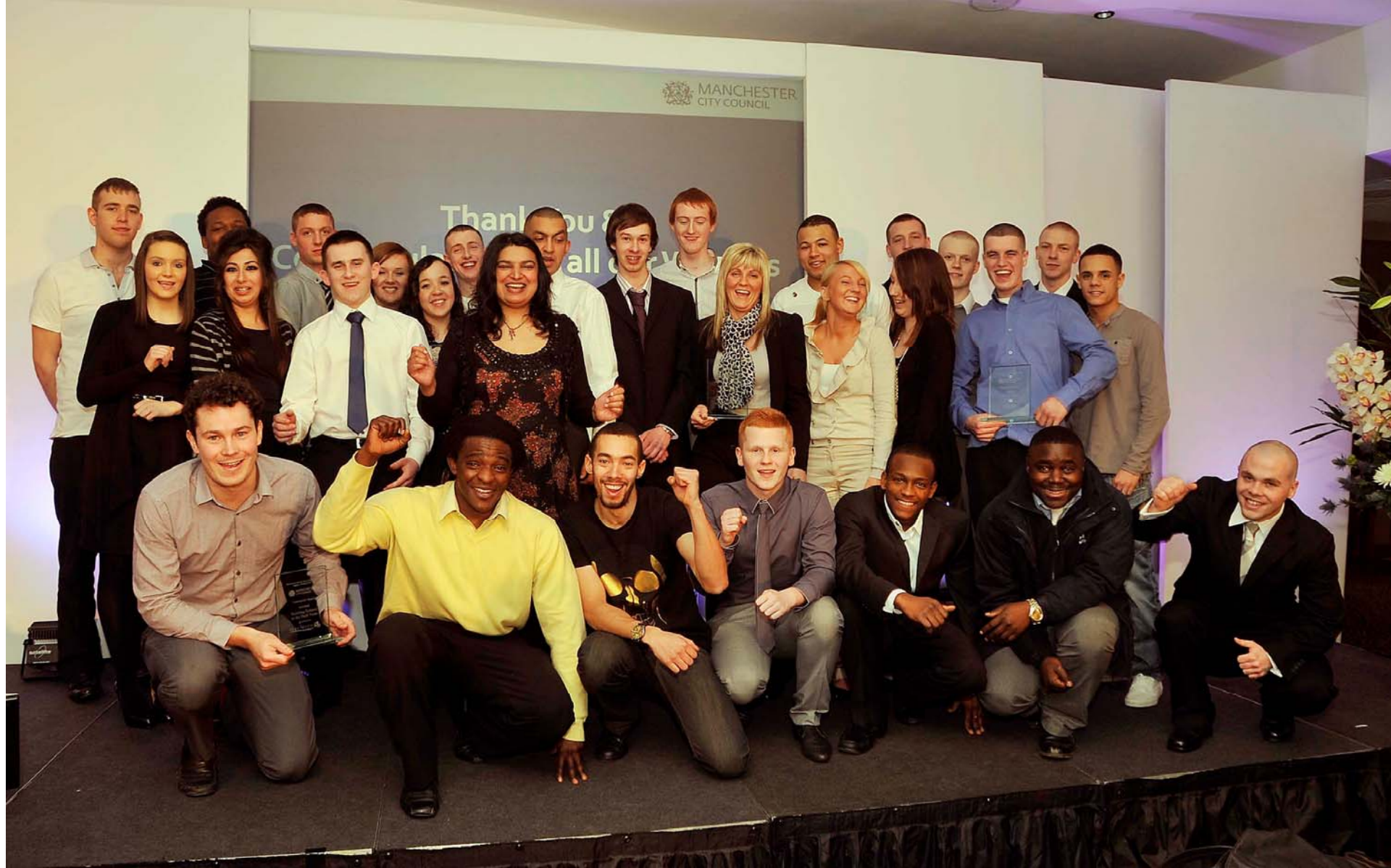
Young People into Construction Success